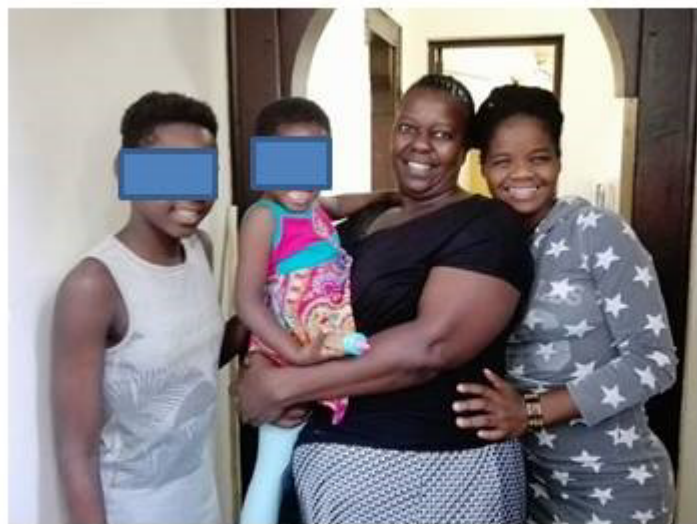
Happy smiles - Standing with one of her siblings and her new caregivers at the Child & Youth Care Centre.

On 20/02/2018 she came to my attention after she was found to be living on the street in unsafe conditions. A statutory investigation was inevitable – never an easy task! The reality of her situation was that she had no suitable family members to consider as possible foster parents; she has developmental delays as a result of her previous living conditions making it difficult to find a foster family willing to take on the responsibility of her care; The C&YCC in PE and surrounding areas did not have an opening for her. Thankfully God answered prayers and answered the mess of her life with one word: “grace.”