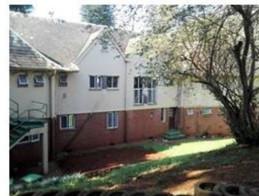
The Child & Youth Care Centre – her new home

CMR THANKS you for your financial contribution to make this possible.